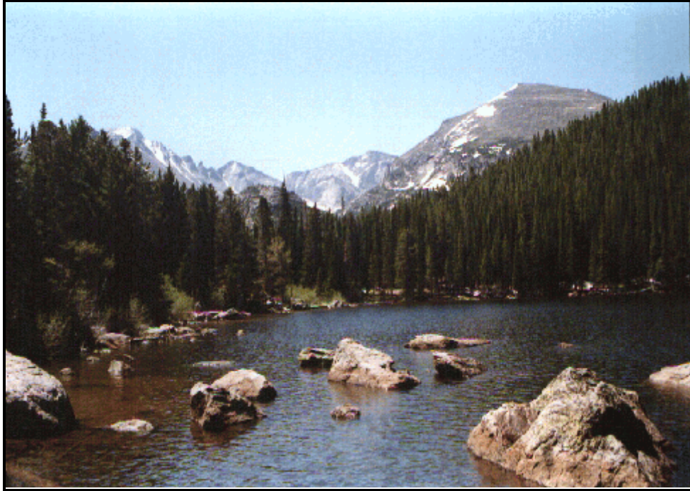
Mountain lake in Colorado.