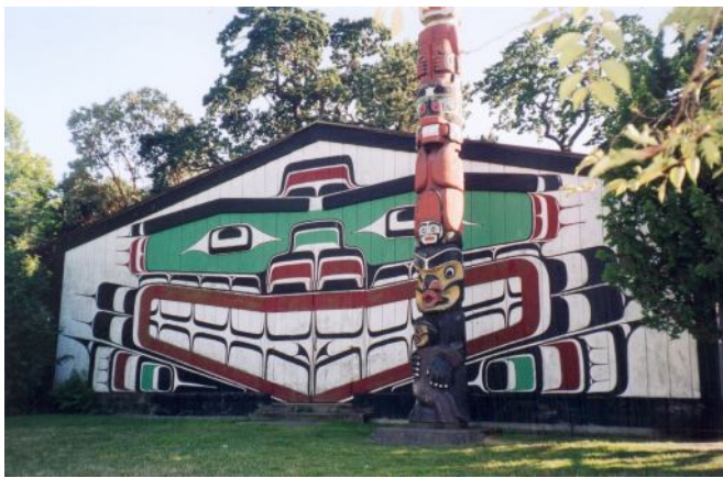
Thunderbird Park, adjacent to Empress Hotel.