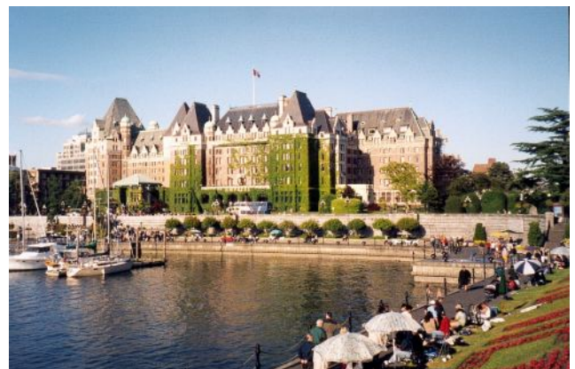
Fairmont Empress, 2004 Conference Hotel. Built in 1908, the Empress serves high tea every afternoon.