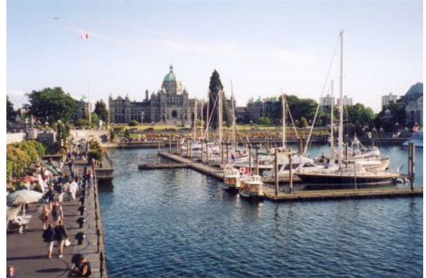
Parliament Buildings and Victoria Harbour.